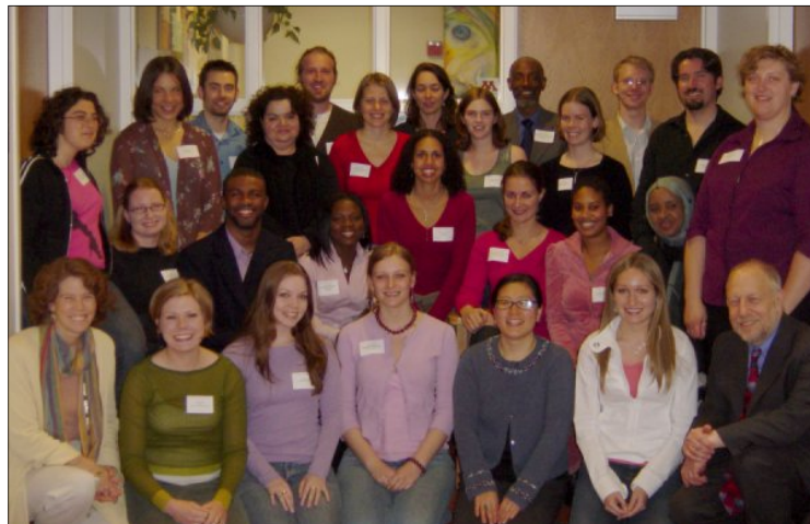
2006 Upper Midwest Fellows with Human Rights Center staff

In its 17 th year, the Fellowship Program supported 28 Fellows as they engaged in human rights and social justice work in Minnesota, the United