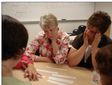
MN educators at a Minneapolis training in July 2006

the world. The Human Rights Center has also distributed over 1,300 This is My Home Toolkits.