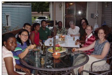
Human Rights Center Staff