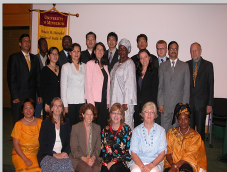
2006-2007 HHH Fellows &amp; Staff

This year's program includes 160 Fellows from over 90 countries. Fourteen of these Fellows have been assigned to the University of Minnesota, coming from 12 different countries all over the world.*